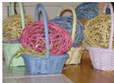
String Easter Eggs are great decorations or party favors. They can be done in solid colors, as seen above, or in a mix of colors (preferable).